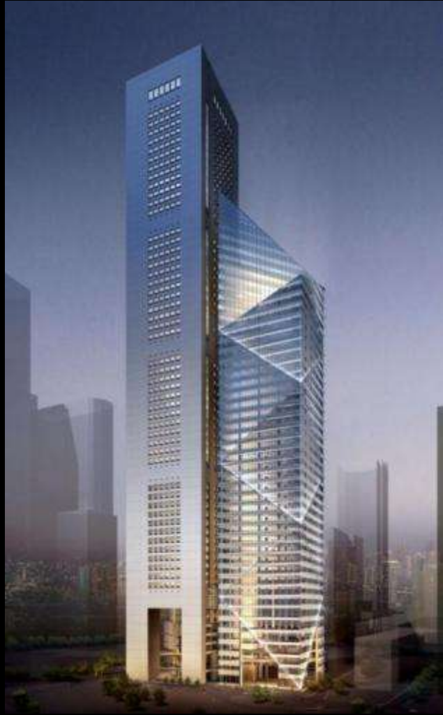
TOWER2 PERSPECTIVE (NIGHT)