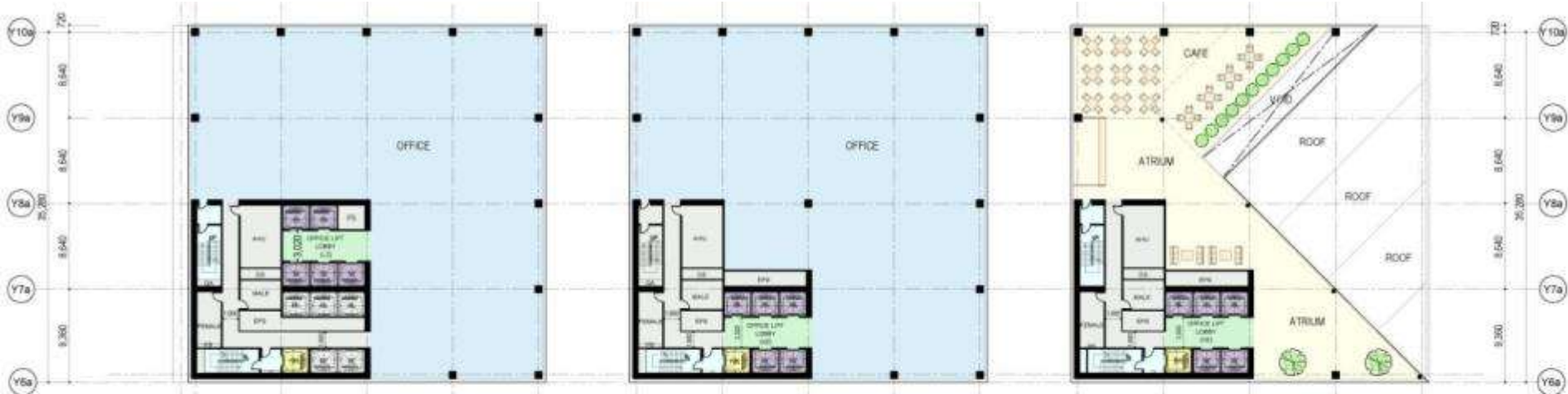
8th to 20th FLOOR PLAN